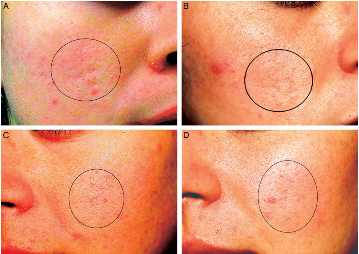
Figure 6. (A) Treated with 2-day PCA with visible improvement. (B) One month after 2-day PCA treatment. (C) Treated only with 24 hour taped phenol with no improvement. (D) One month after 24-hour taped phenol treatment.

debridement and phenol reapplication in the treatment of both scars and deep wrinkles. It argues for the possibility that the 2-day PCA can become the treatment of choice for resurfacing deep scars and wrinkles. The ready availability of a commercially premixed, stable phenol formula (Exoderm and Stone formulations), allows cosmetic surgeons to finally have a phenol peel that can be studied, taught, and used in many clinical applications.