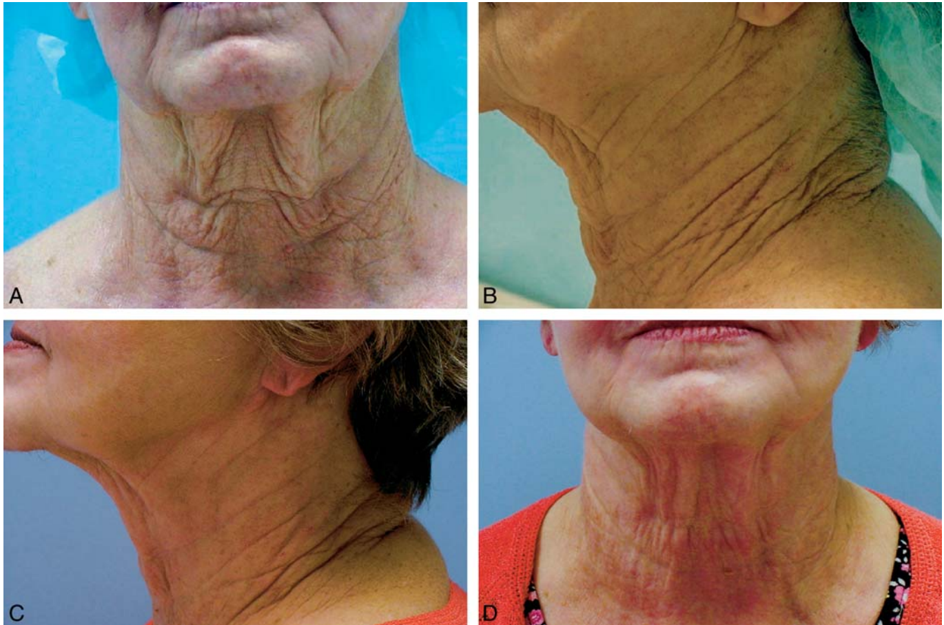
Figure 5. (A) Preoperative patient, age ??, neck peel, frontal view (using Hetter's neck and eyelid formula). (B) Preoperative patient, lateral view. (C) Patient at 1-month postoperative, frontal view. (D) Patient at 1-month postoperative, lateral view.

(touch-ups) resulted in better results. There were no differences in results noted between those treated with Exoderm and those with Stone solutions (Figures 3A and B and 4A and B). There was clinically apparent tissue contraction noted on the neck (Figure 5A and D).