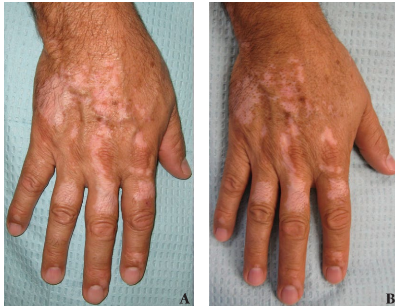
Figure 4. The right hand of a patient with vitiligo before (A) and after (B) 6 treatment sessions with UVB phototherapy.

Treatment of affected skin in patients with psoriasis should overlap the healthy skin at the periphery of the treated site by no more than one or 2 millimeters. With the broadband UV hand piece module for use with the Harmony XL platform, precision adjustments can be made in fluence between 200 to 1000 mJ/cm 2 in 10 mJ/cm 2 increments, and set the pulse duration for 30, 40, or 50 milliseconds. The light beam can pinpoint a treatment area (spot size) as small as 6.4 cm 2 . If a smaller treatment area is required, several round and square templates are available to reduce the treatment area.