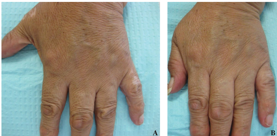
Figure 2. The left hand of a patient with vitiligo before (A) and during (B) treatment with UVB phototherapy.

room, and were expensive to use. The Harmony XL is one laser platform with a modular design, which consists of a base unit and an assortment of handheld modules that attach interchangeably for a variety of different clinical and aesthetic applications.