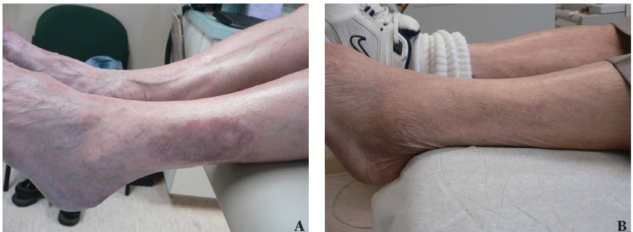
Figure 5. The left leg of a patient with psoriasis before (A) and after (B) treatment with UVB phototherapy.

Based on how well and how quickly the patient responds to treatment, we may keep the same treatment schedule, or drop down to one treatment per week or once every other week until full resolution of psoriasis lesions occurs. No additional treatments are needed during remission in the author's practice. For patients with psoriasis the longest treatment period has been 9 months but the average is 3 months. In the rare