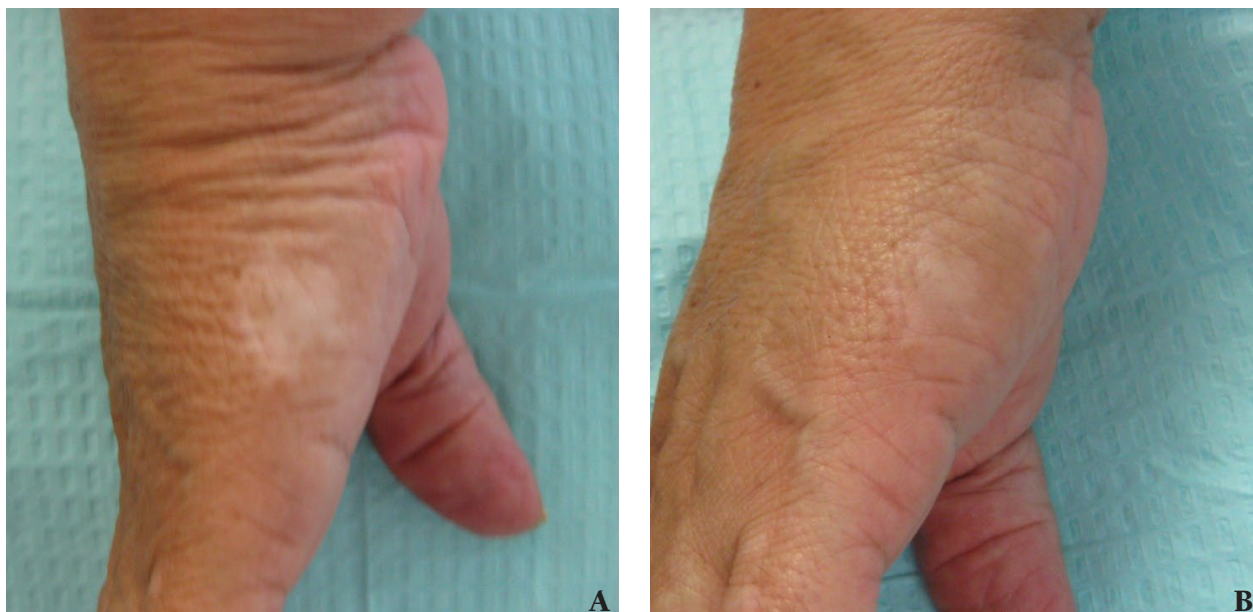
Figure 3. The left hand of a patient with vitiligo before (A) and during (B) treatment with UVB phototherapy.

address isolated tough areas. If the problem areas are localized to begin with, treatment can begin immediately with the handheld broadband UV module of the laser system.