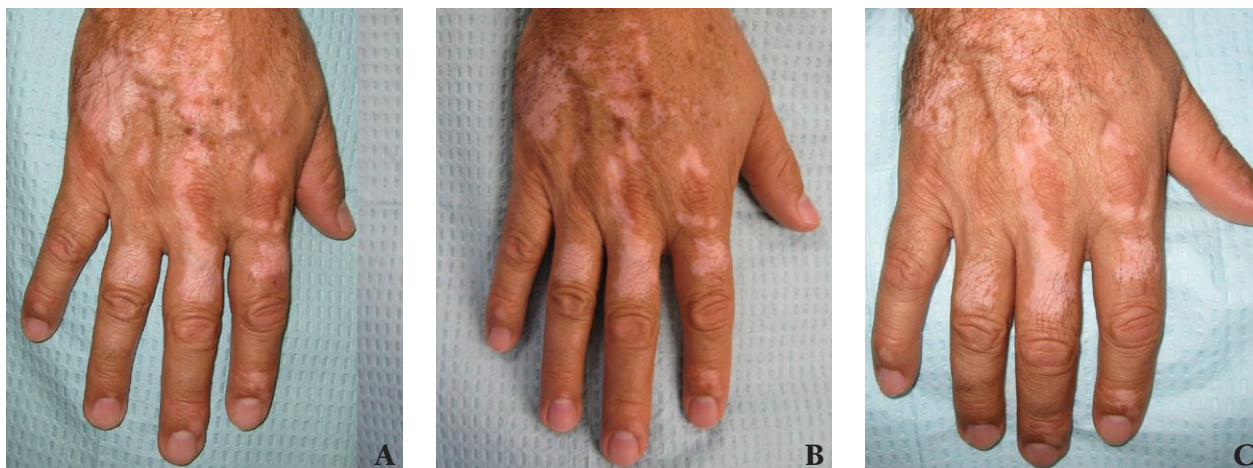
Figure 6. The right hand of a patient with vitiligo before treatment (A), after 6 treatments (B), and after 12 treatments (C) with UVB phototherapy.

occasion where prominent adverse reactions or side effects appear, we simply reduce the dose or delay the subsequent treatment until the symptoms resolve.